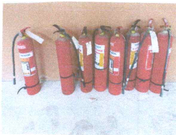
USED FIRE EXTINGUISHERS