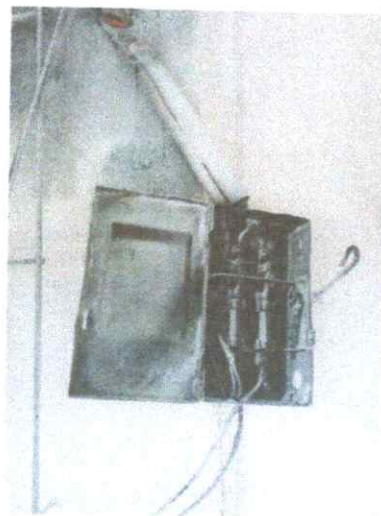
BURNT MAIN BREAKERS AND ELECTRICAL WIRES