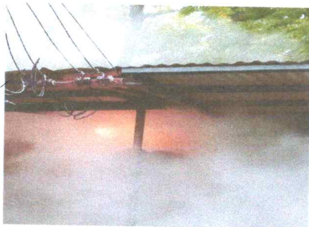
FIRE THAT BURN THE MAIN BREAKER AND ELECTRICAL WIRES